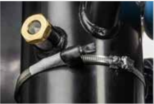
Oil heater → Prevents condensation formed due to intermittent use by maintaining a constant oil temperature while unloading/idle.