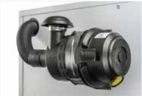
Heavy Duty Air Inlet Filter → Reliable filtration in unclean environments.