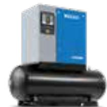
Tank Mounted version without dryer