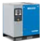
Floor Mounted version without integrated dryer