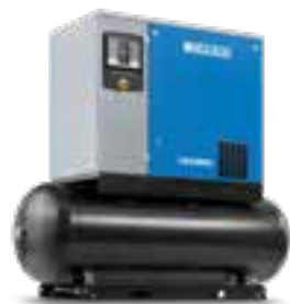
Tank Mounted version with integrated dryer