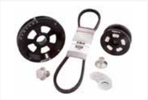
Pressure conversion kit → Gives you the flexibility to store only 1 pressure variant. → Make adjustments depending on the required pressure variant.