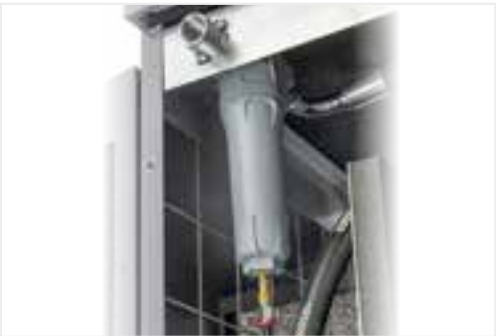
Line filter → Can be added for high-quality air.

The MSA range has a lot of options to further adjust the compressor to your needs: